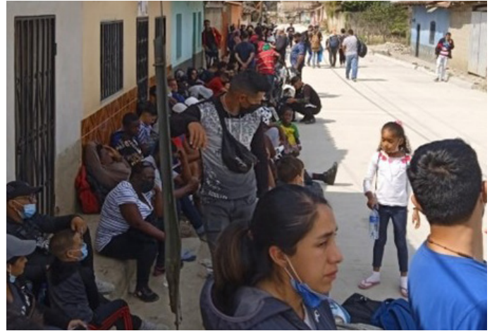
Photos in accommodation provided by families in Danlí and on a street